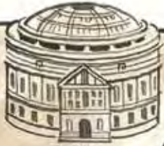
ROYAL ALBERT HALL