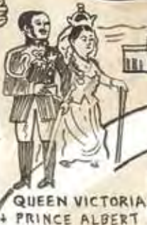
QUEEN VICTORIA + PRINCE ALBERT