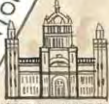
VICTORIA + ALBERT MUSEUM